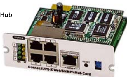
ConnectUPS Web/SNMP xHub

Powerware Modbus Card is an XSlot UPS connectivity device that provides continuous, reliable and accurate remote monitoring of your UPS system through a Building Management System (BMS) or Industrial Automation System (IAS). The card integrates data from the UPS into the user's management system using Modicon®, Modbus RTU Protocol. Key power quality and UPS status information may be monitored in real time to aid in the management of the UPS and notification of potential power problems.