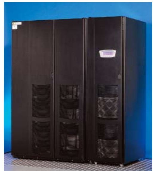
Powerware 9390 line-up (with battery cabinet)

The Powerware 9390 offers small footprint compared to competitive UPS offerings. Cabling can enter the UPS from either the top or bottom of the cabinet to provide easier and flexible installation. Front panel access facilitates services and operation, thereby reducing Mean Time to Repair (MTTR). And since the compact Powerware 9390 cabinet can be installed against back and side walls, you have more location options, installation is fast and easy, deployment cost is lower, and you save valuable data centre space for future expansion.