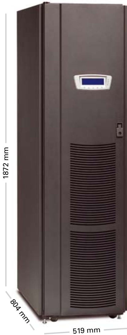
UPS 40-80 kVA dimensions